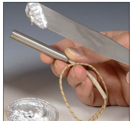
Heat-Away™ 639 coats process heater to improve thermal contact.