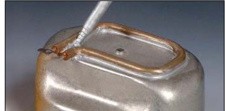
Aremco-Bond™ 568 bonds copper tube heater to reservoir.