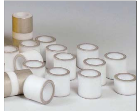
Pyro-Duct™ 597-C metallizes ceramic tubes.