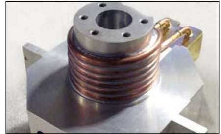
Aremco-Bond™ 568 bonds copper heat exchange tube to aluminum.

Application: Apply adhesive to both surfaces maintaining a glue line of less than 10 mils. Assemble parts and apply pressure to prevent warpage and reduce air entrapment. Refer to curing guidelines in above property chart.